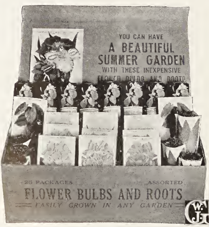
Display Carton Containing 25 Packages Assorted Bulbs and Roots